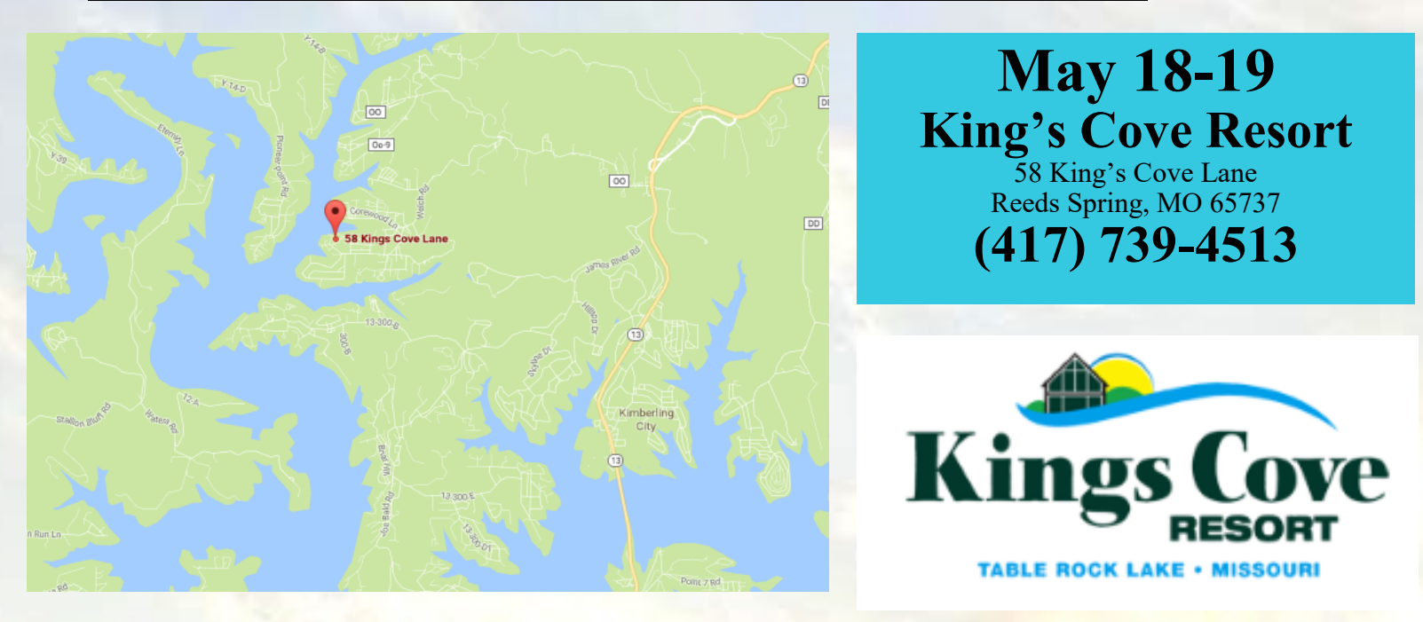
Table Rock Event

Hawg Hawler BBQ - Saturday starting around 5:30pm. The club will be hosting a BBQ which is FREE to all club members. Like previous years, we are asking that you bring a side dish to share. Please let me know what you plan on bringing so we don't have numerous people bring the same thing. Side dish updates will be posted on Facebook and the Hawg Hawlers message board. Some suggestions include: