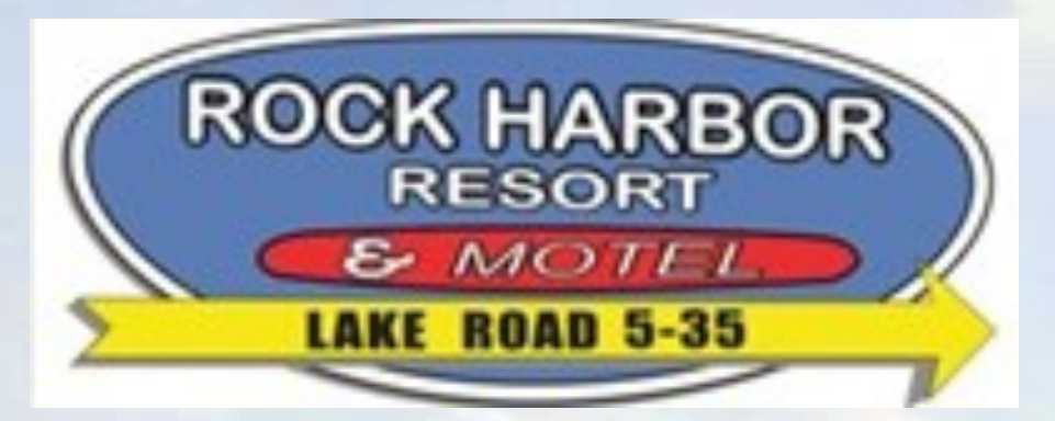
Table Rock Lake