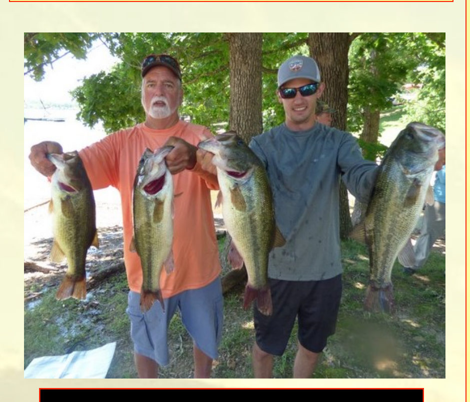
10 Fish 29.30 lbs.