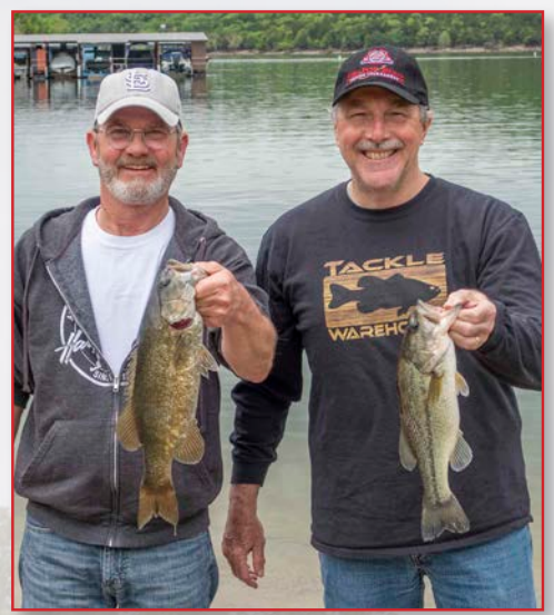
Table Rock 2