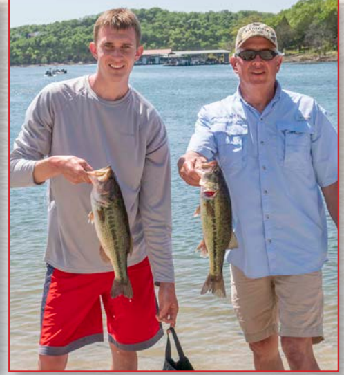
Hawg Hawlers Bass Club