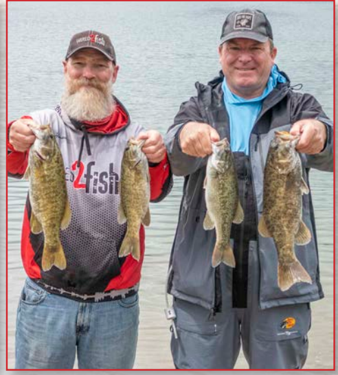
Hawg Hawlers Bass Club