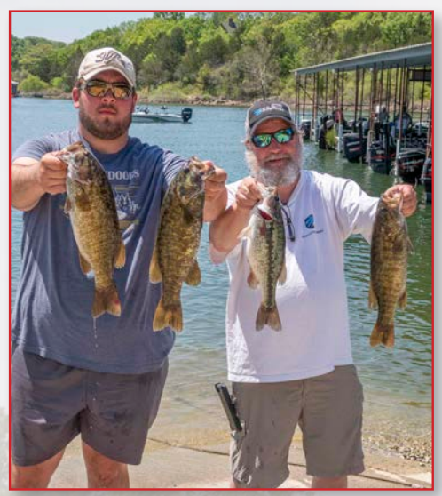
Table Rock 2