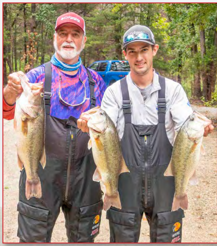
Pomme - 2020