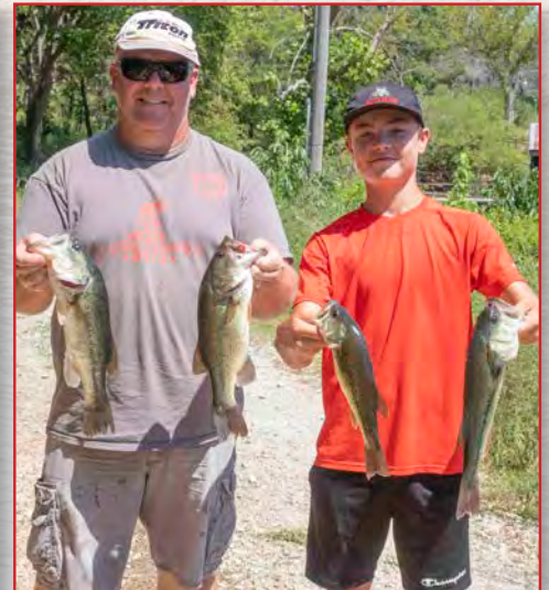
Hawg Hawlers Bass Club