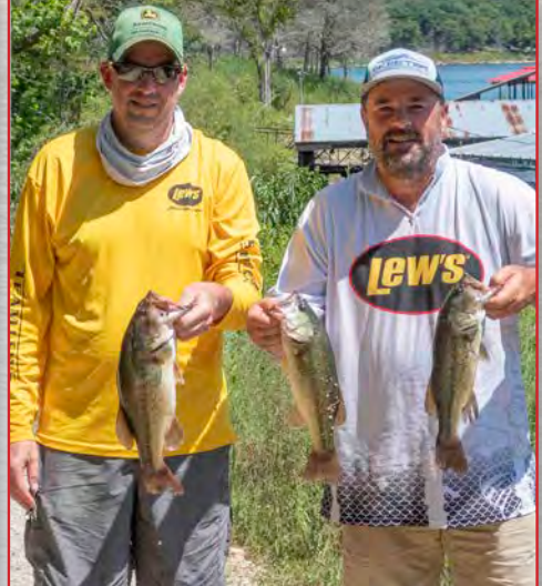
Hawg Hawlers Bass Club