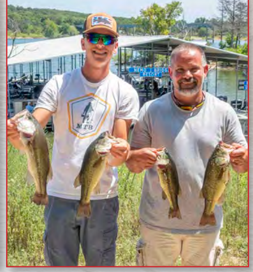
Hawg Hawlers Bass Club